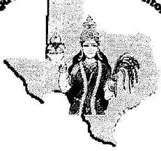
మా తెలుగు శిల్పక మధ్య పూదండ